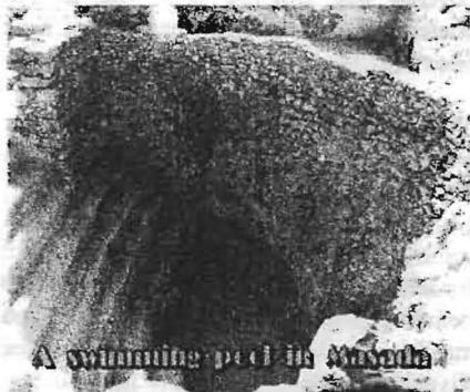
A swimming pool in Masada

Make a trip to the middle of a desert in a modern-day “camel” (with at least 4 wheels and the comfort of air-conditioning) and then taking a cable-car (a real one) ride to the top of a mountain in search of the Ruins of Masada, an ancient fortress which occupies an entire mountaintop near the southeast coast of the Dead Sea and was the site of the Jews’ last stand against the Romans after the fall